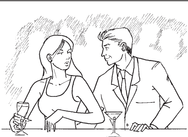
The Elbow Knock: Turn back to glance at the pickup artist and sweep your elbow toward the glass.