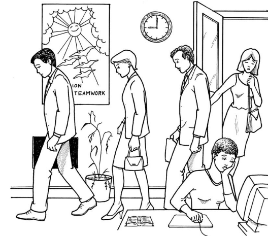
slouching and pouting