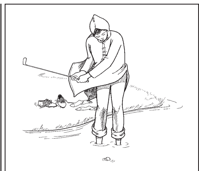
Open the club face slightly. Aim behind the ball, swing down and through it.

Try to determine what is underneath your ball before you swing. Unknowingly hitting a hard surface may damage your hands, wrists, or club.